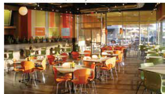
Restaurant Chain/Wallcoverings on Suede