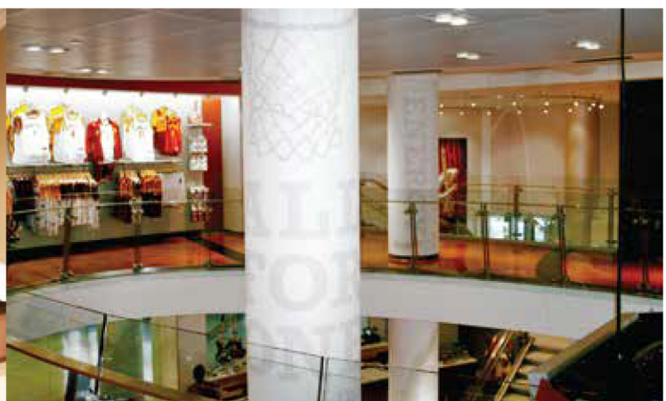
Retail/Columns, Soffits, & Wallcoverings on Suede