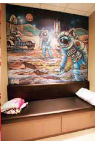
Office/Wallcovering on Mystical