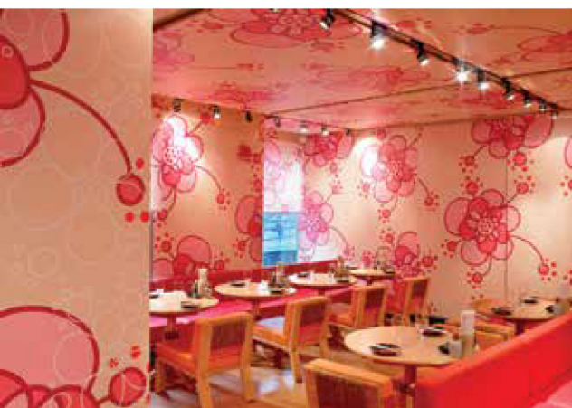
Restaurant/Wall & ceiling coverings on Artist Canvas