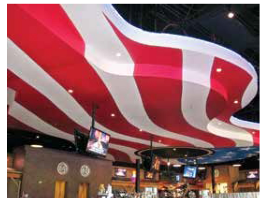
Restaurant/Ceiling Installation on Luster